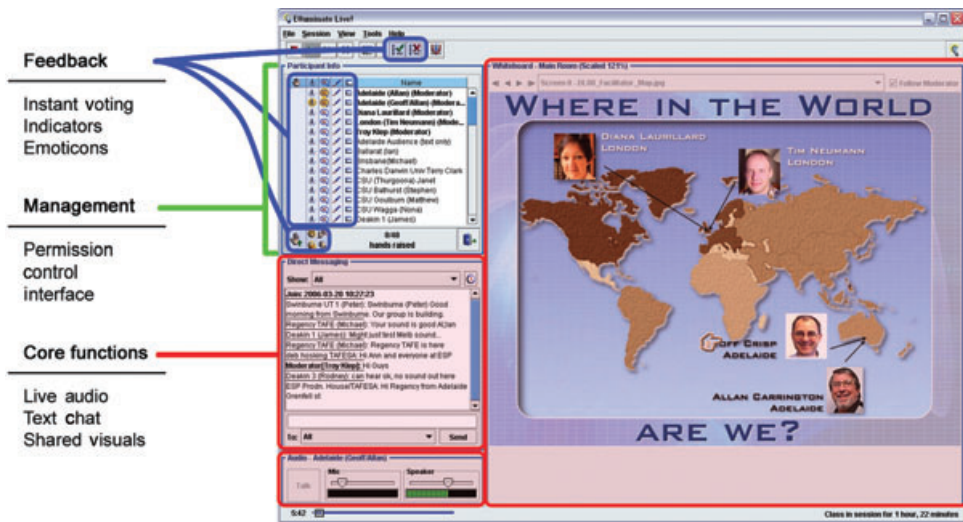
Figure 2: Components of the SAC environment Elluminate. Adapted from Neumann and Carrington (2007)

displays, by handing over or retracting control over certain functions, or sometimes even by looking at a participant's local screen display remotely. Finally, specialised tools may include online questionnaire facilities with an instant-shared graphical analysis of the questionnaire data, live video transmission (although this can exclude some participants because of bandwidth requirements) or live file transfer to share further information during a session. (Figure 2)