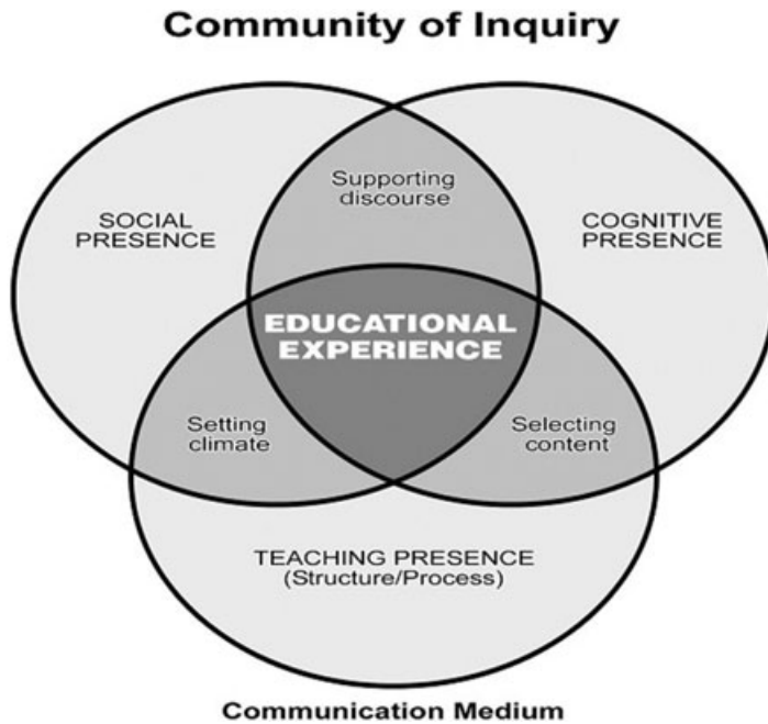
Figure 4: Community of inquiry model.

The first is the design of the educational experience, including the selection, organisation and presentation of the course content. The second element involves facilitation.