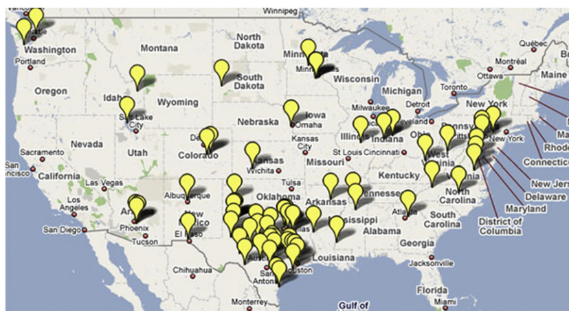
Fig. 2. Location of online course format students by zip code.

The chi-square goodness-of-fit statistic was significant indicating that the model may fit the data, \chi^2(246)=758.79 , p<.05 . The chi-square statistic has been indicated as being sensitive to sample size thus an adjunct discrepancy-based fit index may be used as the ratio of chi-square to degrees of freedom ( \chi^2/df ). A \chi^2/df ratio value less than 5 has been suggested as indicating an acceptable fit between the